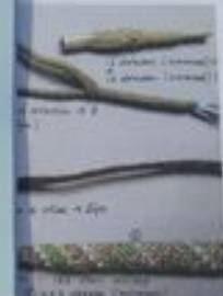
Experimenting with materials